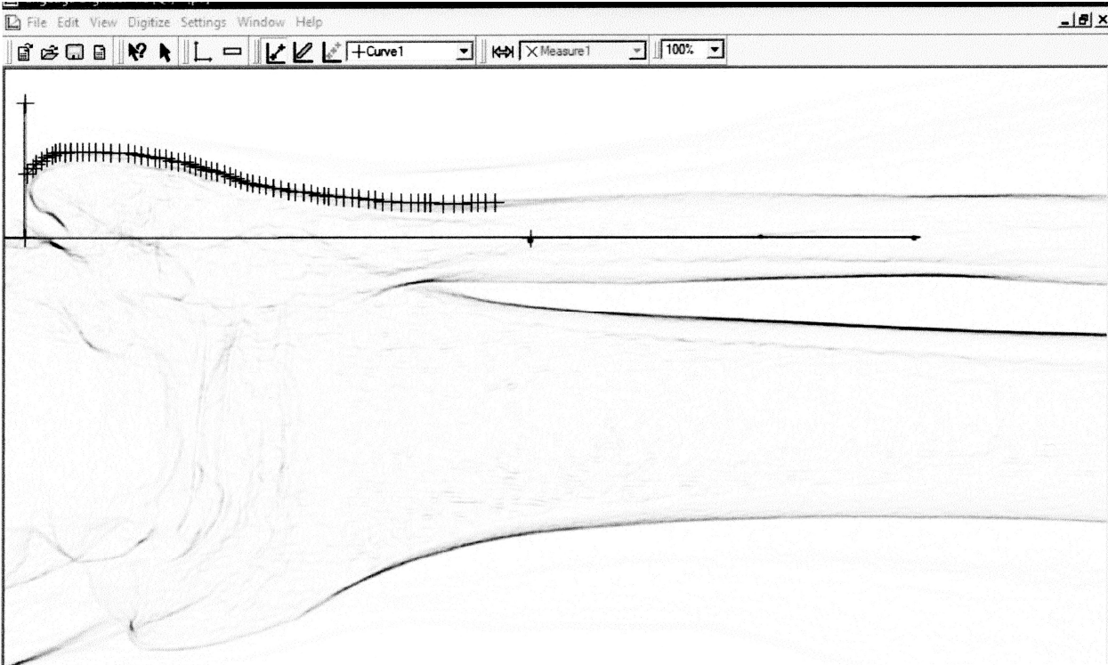
Figure 1. Digitization of one fibula