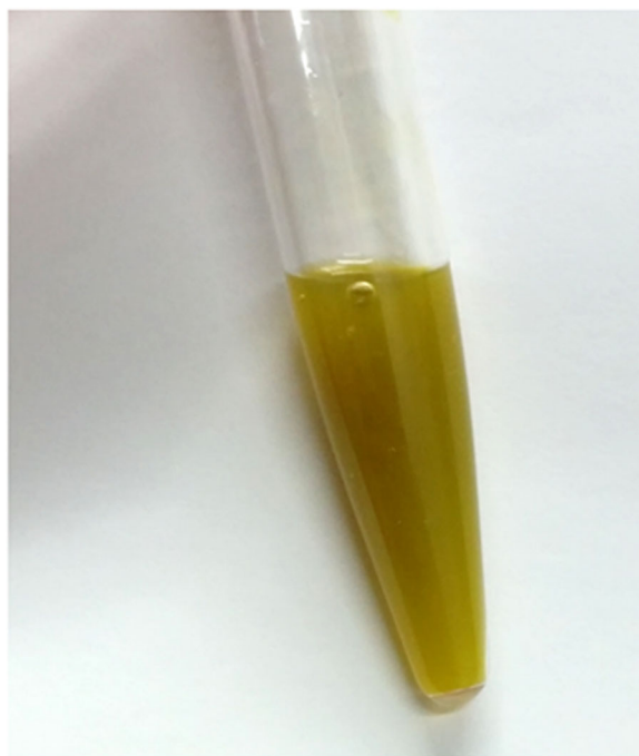
Fig. 2 Diagnostic paracentesis demonstrated ascites with a dark yellow-green color

defects which are considered as gallstones in the common bile duct, and there was no evidence of biliary leakage and pancreaticobiliary maljunction (Fig. 3). Endoscopic retrograde biliary drainage (ERBD) was performed using a plastic stent to reduce the pressure of the common bile duct.