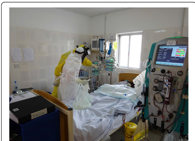
Fig. 2 Ebola treatment facility, Goderich, Sierra Leone—February 2015

For hospitals and intensive care units (ICUs) that will provide definitive care for patients with EVD, there are many Ebola-specific considerations well beyond the scope of this review; however, a number deserve mention.