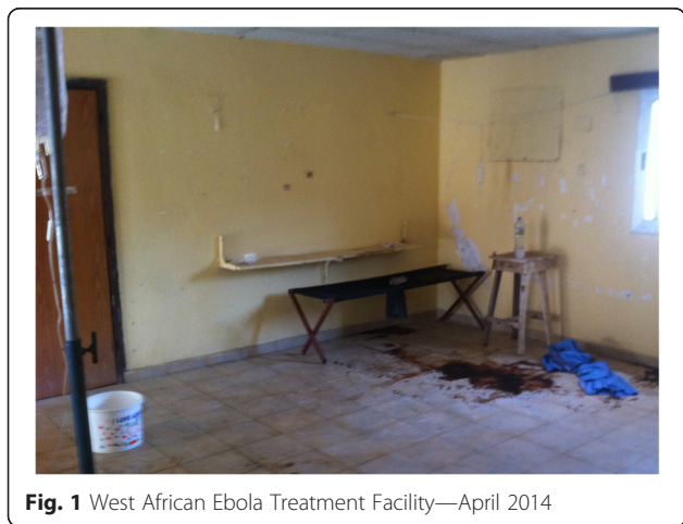
Fig. 1 West African Ebola Treatment Facility—April 2014

a Medical management (including utilization of invasive therapies) is described in peer-reviewed format (Table 3) and in reference [40] LOS length of stay (days), N/A not available