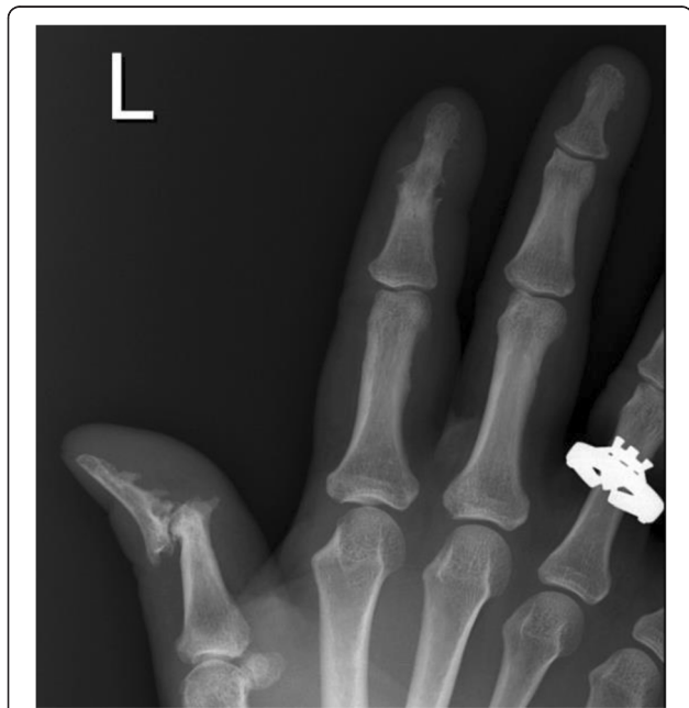
Fig. 2 X-ray image of changes in bones observed in psoriatic arthritis. Bone changes in psoriatic arthritis (PsA) patients may differ between patients and may also differ within the same patient. The heterogeneity observed within a PsA patient is illustrated. Left-hand radiograph from a PsA patient showing severe erosive disease and subluxation at the first distal interphalangeal (DIP) with fluffy periosteal new bone formation on the terminal phalanx. Ankylosis of the second DIP joint is also demonstrated

Biomarkers serve as objective molecular indicators of pathological processes such as the development of joint destruction. Owing to the heterogeneous nature of RA and PsA, identifying a single biomarker predictive of joint damage would be an onerous task. Indeed, no single biomarker has so far emerged as a reliable predictor