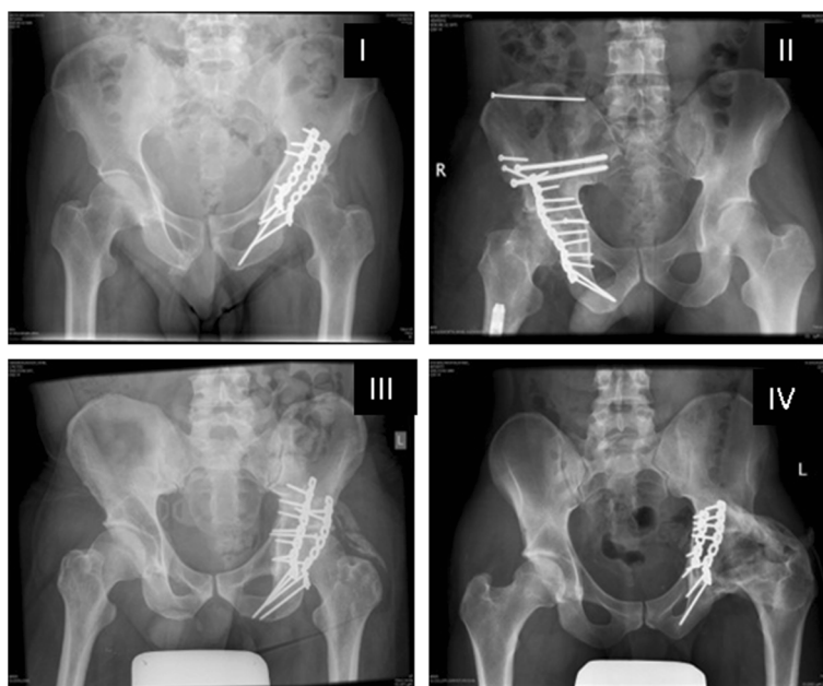
Figure 1 Different grades of heterotopic ossification according to the Brooker classification. I: X-ray of a Brooker class I heterotopic ossification (left hip): ‘islands of bone within soft tissues around the hip’. II: X-ray of a Brooker class II heterotopic ossification (right hip): ‘bone spurs in pelvis or proximal end of femur leaving at least 1 cm between the opposing bone surfaces’. III: X-ray of a Brooker class III heterotopic ossification (left hip): ‘bone spurs that extend from the pelvis or the proximal end of femur, which reduce the space between the opposing bone surfaces to less than 1 cm’. IV: X-ray of a Brooker class IV heterotopic ossification (left hip): ‘radiographic ankylosis of the hip’.

subscales need to be summed up, using the following formula for all dimensions.