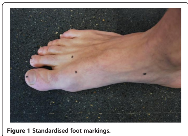
Figure 1 Standardised foot markings.

Once the foot was placed in the reference position, a carpenter's square was placed at the end of the first toe in order to keep it aligned with the lines of the graph paper. The investigator then used a paint spatula that had been dampened using a blue ink stamp pad, to make a blue line parallel to the graph lines at the end of the toe, between the first toe and the edge of the square. The procedure was repeated under identical conditions with the second toe (Figure 3). The difference between the ends of both toes was determined using a ruler in