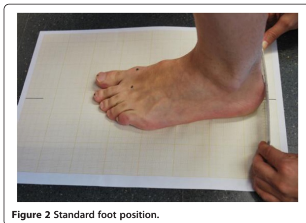
Figure 2 Standard foot position.

Using the method described by Davidson et al. [12], the dorsal crease of the first and second metatarsophalangeal joints as well as the medial aspect of the navicular tuberosity were identified and marks made at each of these bony landmarks (Figure 1). A vertical reference line, between one point at the base of the calcaneum