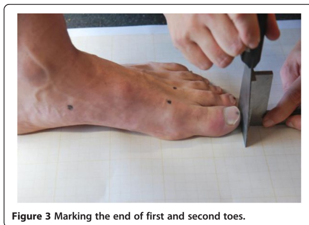
Figure 3 Marking the end of first and second toes.