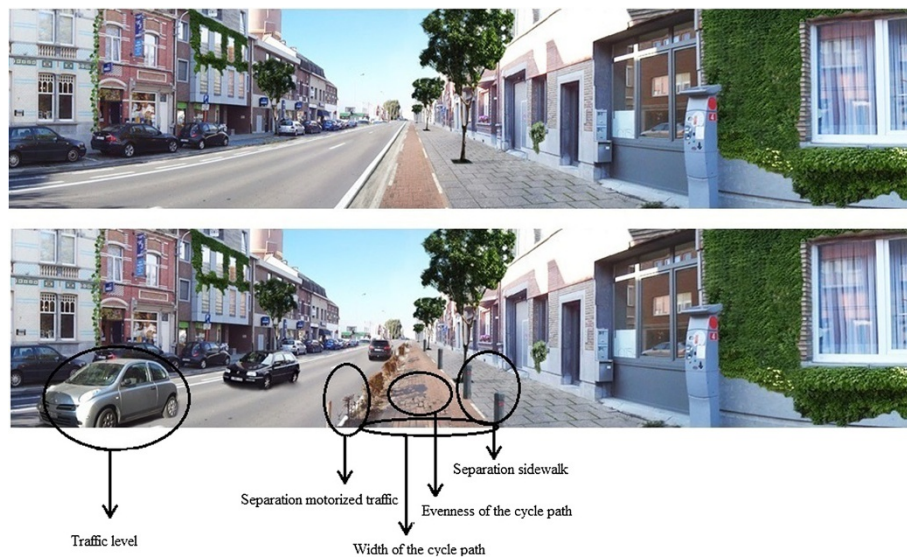
Figure 2 Examples of manipulated photographs from set B with 5 environmental factors manipulated.

During the home visit, the participants were asked to do two similar sorting tasks (one for each set of 32 colored photographs). Before starting the sorting task, the researcher randomly scattered all 32 photographs on a table and read the following standardized instructions out loud: Imagine yourself cycling to a friend’s home located at