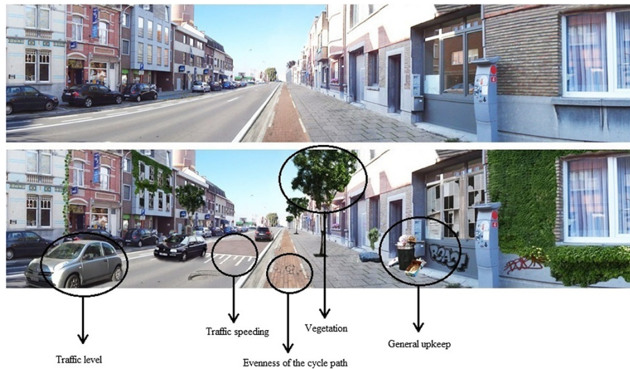
Figure 1 Examples of manipulated photographs from set A with 5 environmental factors manipulated.

path was manipulated by depicting a narrow or wide cycle path.