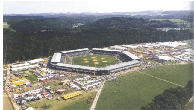
FIGURE 2: Overview over the main part of the venue.

senior staff member of civil defense. This on-site operational management team was located directly on the festival ground and communicated closely with the medical assistant points and hospitals if necessary.