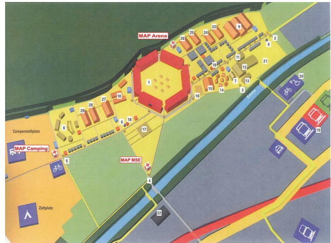
FIGURE 1: Overview of the event site and medical assistant points (MAP).

The civil EMS coordinated the medical care on site, together with the Swiss Armed Forces and Swiss civil defense, that supported the EMS with medically trained personnel and equipment. The on-site operational management team comprised two senior staff members of the Bern EMS and one