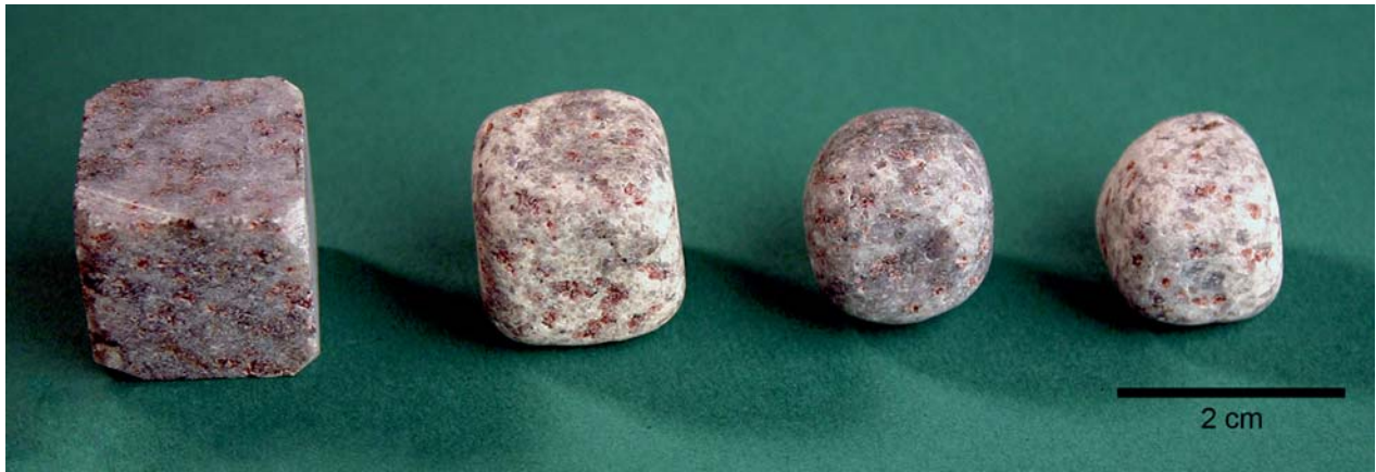
Figure 3. Rock-sawed cubes of the granite standard sample used in the experiment. The left stone is an original sample used for the tests (weight: 22.3 g), the second stone from the left was moved for approximately 180 days in the artificial stomach (weight: 18.9 g), the second from the right was moved for approximately 180 days in the tumbler filled only with water (weight: 12.2 g), the stone on the right was retrieved from an ostrich gizzard after 50 days (weight: 10.7 g). Note that the abrasion in the ostrich gizzard was higher than in other experiments, in spite of a shorter residence time. The lowest abrasion rate occurred in the artificial stomach.

juices would have caused major disturbance to the experimental setting. After the experiments, changes of surface texture of stones (river gravel, artificially polished stones, rock cubes) from both experiments were examined via close-up photography and stereo light microscopy. Ostrich gastroliths, including quartz samples which had a similar artificial polish before they were ingested by the ostriches, were used for comparison (Wings & Sander 2007). Denotation of luster is based on commonly used terms of light reflection on mineral surfaces (Klein et al. 1993).