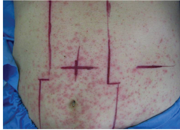
FIGURE 5: Papulopustules on irradiated area. A 65-year-old man with non-small-cell lung cancer stage IV and cauda equina syndrome was admitted for radiation. Erlotinib was given 7 days ago. After 2 days of radiotherapy he developed papulopustular eruption predominantly on the irradiation field.

8.1. Antibiotics: Tetracycline and Tetracycline-Class. To date, there are 4 published randomized control and 1 meta-analysis