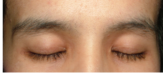
FIGURE 3: Trichomegaly. Trichomegaly developed in a 40-year-old woman, 3 months preceding erlotinib. Notice the wavy, curly, and aberrant elongation of the eyelashes.

Follicular pustules may infrequently occur [22]. Extensive scalp pustules may lead to scarring alopecia (Figure 4). Hair loss both scarring and nonscarring inflammatory alopecia have also been reported [23, 24]. The precise mechanism for