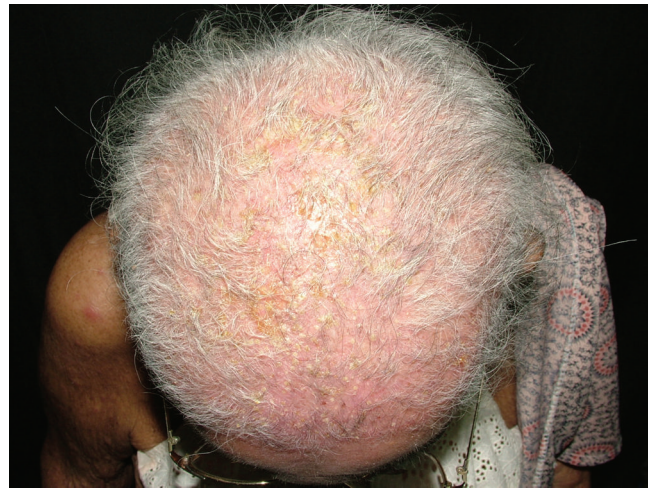
FIGURE 4: Scalp pustule and scarring alopecia. A 78-year-old woman developed follicular centered pustular eruption on the scalp and scarring alopecia after 3 months of erlotinib.

inflammatory hair loss is unclear but may possibly reflect severe endpoint of the follicular papulopustular eruptions [24]. Hair curling and rigidity and hair repigmentation or depigmentation have been reported [25].