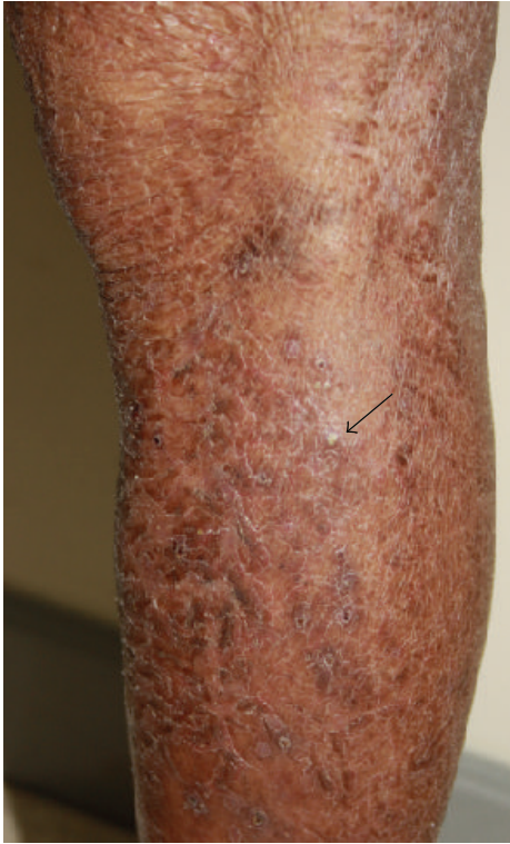
FIGURE 2: Xerosis. Ill-defined dried scaly patch with mild erythema on the left leg, occurring 3 weeks following gefitinib. Notice scattered pustules, showing evidence that xerosis took place where papulopustules have developed.

more widespread involvement usually occurs (Figure 2) [7, 8].