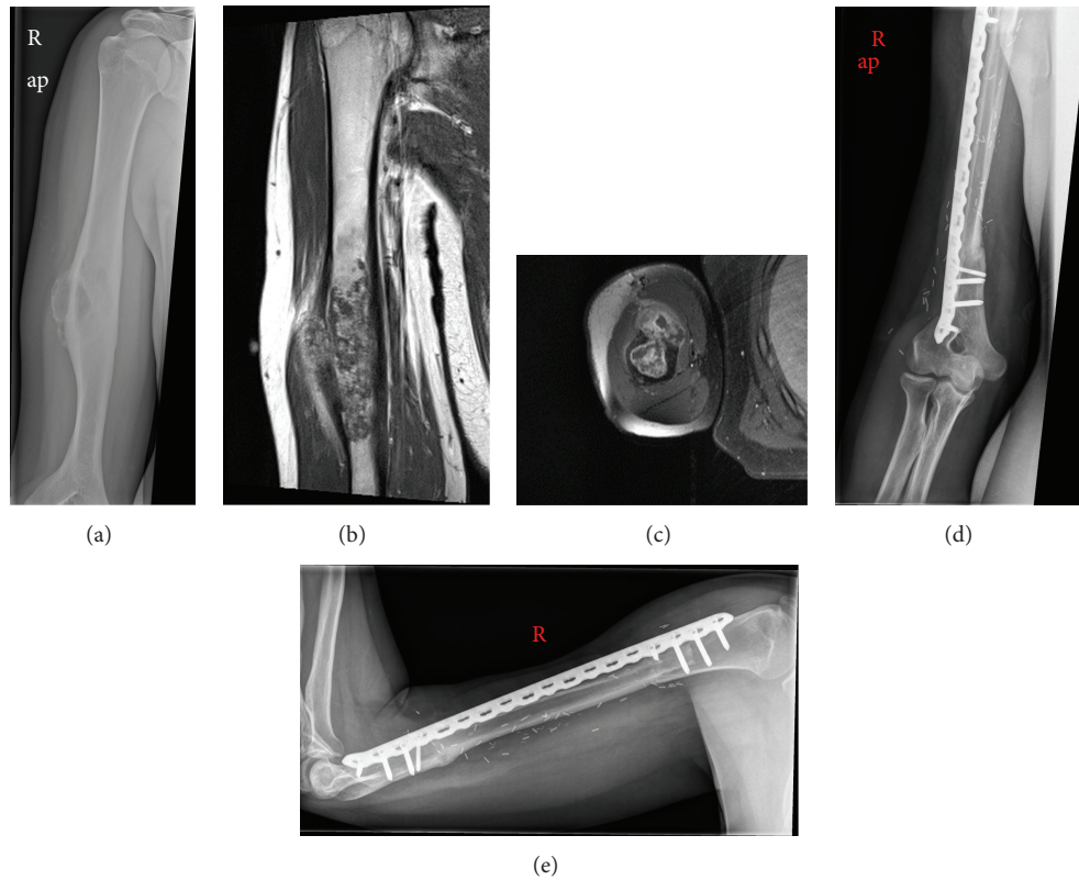
FIGURE 2: Chondrosarcoma G2 at the proximal humerus shown in the X-ray (a) and MRI ((b), (c)). Nine-month postoperative X-rays showing the reconstruction after wide resection with an autologous free vascularized fibula graft ((d), (e)).

transplanted fibulae is high with up to 50%. In cases of fibula graft use solely without any allograft, fracture rates are even higher. In the lower extremity rates are lower and seen in up to a fifth of transplant recipients. Generally, longer grafts are more likely to fracture than shorter grafts [29].