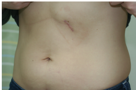
FIGURE 3: Postoperative scar of left-sided LAMP-TPA.

the right adrenal gland is solely achieved through retraction of the liver, which can be avoided with a posterior approach.