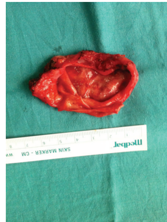
FIGURE 3: Resected cystic lesion.

Bronchogenic cysts are sacs filled with fluid. The radiologic diagnosis may be difficult because of air-fluid level or variable protein content as in case of an infection [5, 9]. As in our case, computerized tomography aids in preoperative diagnosis; however, differentiation between infections such as hydatid disease, a malignancy, or for the exact origin (i.e., pericardial, enteric, bronchogenic, or others) of the