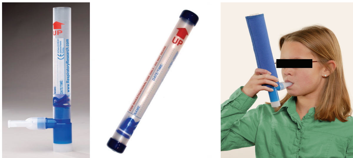
FIGURE 3: RTube device for exhaled breath condensate (EBC) collection (Respiratory Research, Inc., USA). RTube disposable collection system consists of a large Tee section (from polypropylene (PP)), which separates saliva from the exhaled breath, an one-way valve (from silicone rubber), and a PP collection tube, which is cooled by a cooling-sleeve placed around. RTube is portable and can be used by unsupervised subjects at home.

[1]. Sampling duration varies among studies from 10 to 30 min, but collection of up to 60 min has also been described [13, 14]. In EcoScreen device, total EBC volume is proportional with total exhaled volume, breathing frequency and total EBC protein and urea concentrations [15]. However, when using Rtube, where the temperature of cooling chamber is increasing with condensation, not much EBC is added after 10 min of sampling.