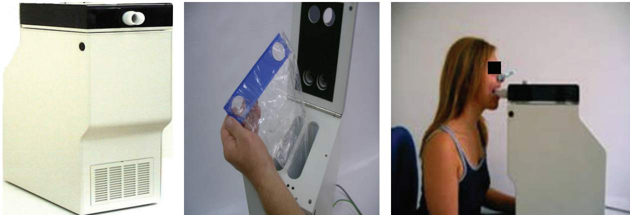
FIGURE 1: EcoScreen 2 device for exhaled breath condensate (EBC) collection (FILT Lungen-& Thorax Diagnostik GmbH). EcoScreen 2 electrically refrigerates exhaled air, conducted through a lamellar PTFE coated aluminum double lumen system. EBC is formatted in a disposable polyethylene bag (at approximately -10^{\circ}\text{C} ). It also allows the fractionated collection of EBC from different areas of the bronchial tree into two disposable polyethylene bags, so that the dead space condensate which contains biomarkers of no clinical relevance can be discarded. The device is not portable and weighs 20 kg (published with permission from FILT Lungen-& Thorax Diagnostik GmbH).

gastroesophageal reflux, GERD, chronic obstructive pulmonary disease, smoking, COPD, lung cancer, mechanical ventilation, non small lung cancer, NSCLC, cystic fibrosis, pulmonary arterial hypertension, PAH, idiopathic pulmonary fibrosis, interstitial lung diseases, obstructive sleep apnea, OSA, and drugs.