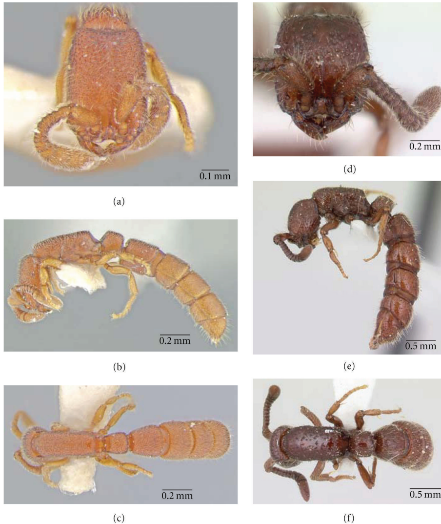
FIGURE 1: Sphinctomyrmex marcoyi . (a)–(c): Holotype worker from Manaus, AM, Brazil: (a) head in full face view, (b) lateral view, (c) dorsal view. specimen CPDC 6(4832). Sphinctomyrmex schoerederi . (d)–(e): Holotype worker from Viçosa, MG, Brazil: (d) head in full face view, (e) lateral view, (f) dorsal view. specimen CASENT 0178849.

anterior margin of clypeus with two lateral lobes projecting over the mandibles, abdominal segments IV to VII with strongly developed pretergites, and the presence of short appressed hairs on the dorsal surface of gaster.