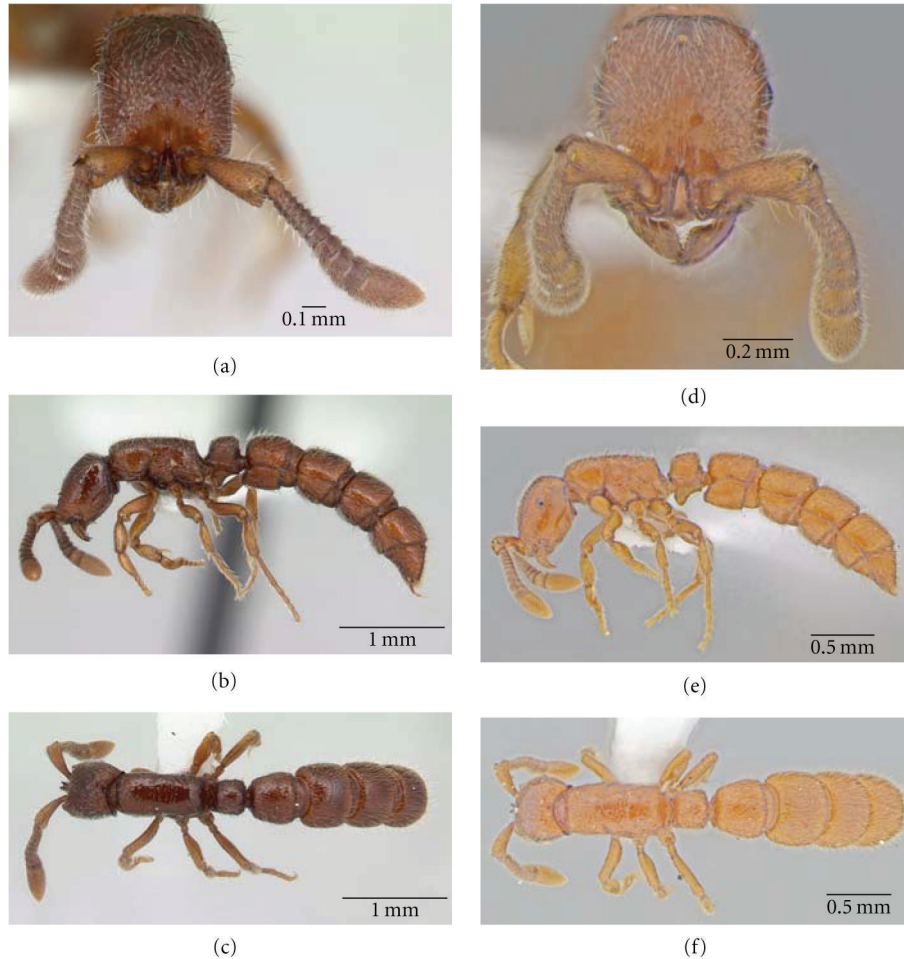
FIGURE 2: Sphinctomyrmex stali . (a)–(c): worker of morphotype 1 from São Bonifácio, SC, Brazil (a) head in full face view, (b) lateral view, (c) dorsal view. specimen CASENT 0178866. (d)–(f): ergatoid from São Bento do Sul, SC, Brazil (d) head in full face view, (e) lateral view, and (f) dorsal view.

moderately developed. Abdominal segments IV to VII with strongly developed pretergites, separated from each other by comparatively shallow and wide constrictions.