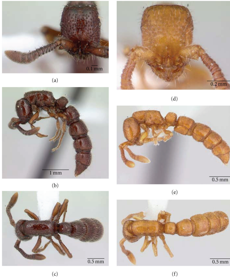
FIGURE 3: Sphinctomyrmex stali . (a)–(c): worker of morphotype 2 from Ubatuba, SP, Brazil (a) head in full-face view, (b) lateral view, and (c) dorsal view. specimen CASENT 0178865. (d)–(f): worker of morphotype 3 from Viçosa, MG, Brazil (d) head in full-face view, (e) lateral view, (f) dorsal view. specimen CASENT 0178850.

Worker Description. Size highly variable (TL 3.33–4.64). Body yellowish to black, commonly reddish-brown with slightly lighter appendages. Pilosity dense; gaster devoid of appressed pilosity. Posterior area of head (nuchal area) smooth to coarsely striate; dorsum of body sparsely foveolate; space between the foveae predominantly smooth and shiny; declivous face of propodeum smooth and shiny to shallowly punctuate-reticulate; sides of meso- and metasoma predominantly smooth and shiny, with a few coarse punctures.