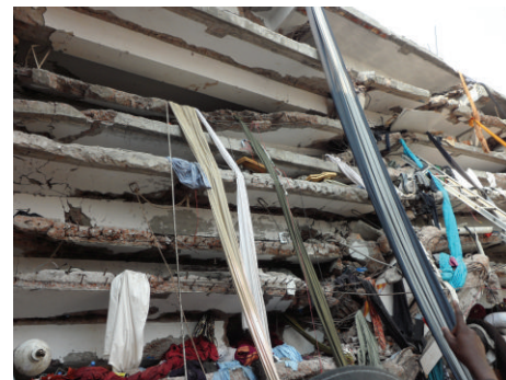
FIGURE 3: What happened after Rana Plaza collapsed.

Due to the continuous news updates, many people started to come to the place to help and join the rescue process. Like this, many people also provided support and aid by knowing the facts through live telecasts and radio news updates. Moreover, the printed media detailed the entire situation including regular updates on how many people were rescued, how many were still missing, and how many of them had already died. People also read that news from newspapers and came to help the injured people. A few printed newspapers started a fund for the victims and many people donated money to the newspapers' bank account.