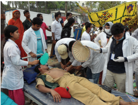
FIGURE 5: Treatment at make-shift camp after Rana Plaza collapsed.

and put bandage. We also found huge number of patients with fractures; we provided first aid of fracture and referred them to the hospital immediately.