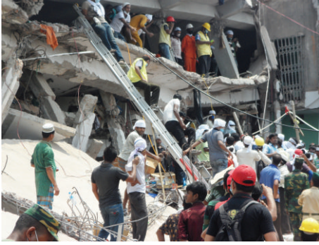
FIGURE 4: Rescue at Rana Plaza collapse.