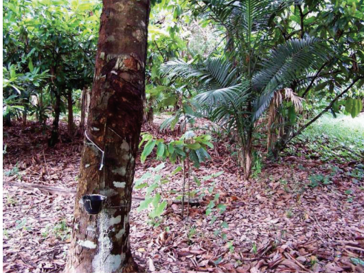
FIGURE 1: Agroforestry system with rubber ( Hevea brasiliensis ), cacao ( Theobroma cacao ), and açai ( Euterpe oleracea ) in Tomé-açu, Pará, showing the litter layer that is typically found in such multistrata systems.