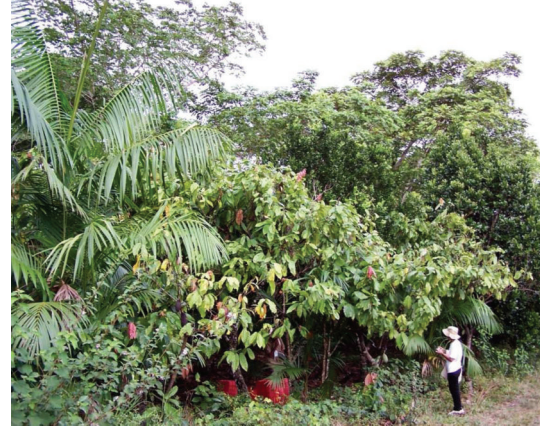
FIGURE 3: Multistrata agroforestry system in Tomé-açu, Pará, with harvest of hogplum ( Spondias mombin ) grown as the upper canopy over cacao and açai.

While trees in general can provide a number of environmental benefits in both rural and urban landscapes, and play key roles in ecosystem services provided by natural areas, in this paper we will restrict our focus to the effects of trees on soil fertility, in the specific context of agricultural systems. Although the benefits that trees can provide on rural properties such as food security, household income, economic stability, and thermal comfort (shade) are most often associated with their products, such as fruit, timber, or other items, the inclusion of trees in agricultural systems can also optimize nutrient cycling and have positive effects on soil chemical and physical properties. This process is especially important in tropical soils, where a high degree of weathering has created deep, leached soils that are poor in