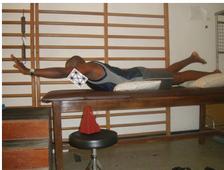
FIGURE 9: Exercise position 4: prone position and head, trunk and contralateral arm and leg lifted off the plinth from neutral to extension for static and dynamic back extensors endurance exercise.