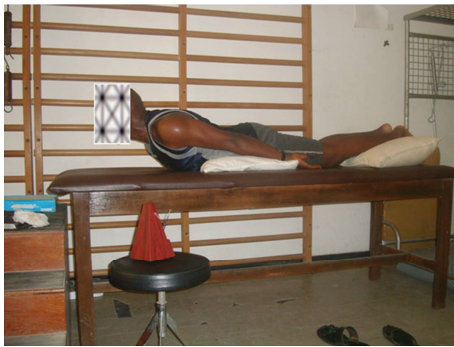
FIGURE 6: Exercise position 1: prone position with arms by the sides of the body, and head and trunk lifted off the plinth from neutral to extension for static and Dynamic Back Extensors' Endurance exercise.

instructions which comprised a 9-item instructional guide on standing, sitting, lifting, and other activities of daily living for home exercise for all the participants.