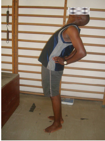
FIGURE 5: McKenzie's extension exercise posture in standing.