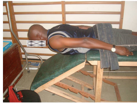
FIGURE 2: Horizontal phase of the Repetitive Arch-Up Test.

2.2.2. Assessment of Dynamic Back Extensors' Endurance. Repetitive Arch-Up Test (RAUT) was used to assess the static back endurance. During the test, the participant lay in a prone position on the plinth with the arms positioned along the sides. The iliac crest was positioned at the edge of the plinth. The lower body was fixed to the plinth by two non-elastic straps located around the pelvis and ankles. With the arms held along the sides touching the body, the subject was asked to flex the upper trunk downward to 45^\circ as indicated by a board. The participant then raised the upper trunk upwards to the horizontal position followed by returning back downward to 45 degrees to complete a cycle. The repetition rate was one repetition per two to three seconds. The movement was repeated as many times as possible at a constant pace synchronous to a metronome count. Once the movement becomes jerky or nonsynchronous, or did not reach the horizontal level, the subject was encouraged once to immediately correct the motion again. The test was terminated once the participant could not go on with the tempo of the motion or reported fatigue or exhaustion [39] (Figures 2 and 3).