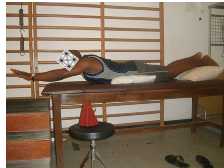
FIGURE 8: Exercise position 3: prone position with both arms elevated forwards, and head and trunk lifted off the plinth from neutral to extension for static and dynamic back extensors endurance exercise.

holding the positions of the upper and lower limbs suspended in the air during all the five exercise progressions for the 10 seconds, the participant was asked to move the trunk and the suspended limbs 10 times (Figures 6, 7, 8, 9, and 10).