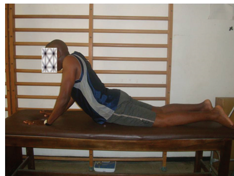
FIGURE 4: McKenzie's extension exercise posture in lying.

2.3. Treatment. The participants were instructed in details on the procedures of study at inclusion. Treatment for the different groups was in three phases comprising warmup, main exercise, and cooldown, respectively. The warm-up phase involved a low-intensity activities comprising stretches and strolling at self-determined pace around the research venue for aduration of five minutes. Treatment also ended with a cool-down phase comprising of the same low-intensity exercise as the warm-up for about five minutes.