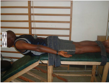
FIGURE 1: The modified Biering-Sorensen test of static muscular endurance position.

The modified BSME and RAUT were performed in random order among the participants with a 15-minute interval provided between both tests. The tests ended with a cool-down phase, comprising the same low-intensity stretches and strolling around the research venue for about five minutes.