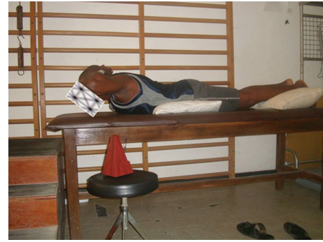
FIGURE 7: Exercise position 2: prone position with hands interlocked at occiput so shoulders are abducted to 90° and elbows flexed, and head and trunk lifted off the plinth from neutral to extension for static and dynamic back extensors endurance exercise.

2.3.2. Dynamic Back Extensors Endurance Exercise. In addition to completing the MP, dynamic back extensors endurance exercise included five different exercises. The dynamic back endurance exercise was an exact replica of the static back extensors endurance exercise protocol in terms of exercise positions, progressions, and duration. However, instead of static posturing of the trunk in the prone lying position and