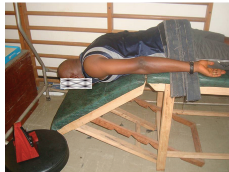
FIGURE 3: Downward phase of the Repetitive Arch-Up Test.