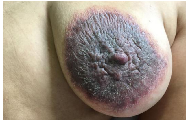
Figure 2: Lamellar scales and infiltration throughout the lesion.