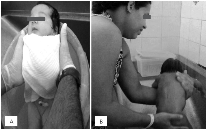
Figure 1: Bathtub and shower respectively.

A: Hot tub bath: newborn wrapped in a towel, body semiflexed and placed gently inside the bucket, in the water, in order to keep body organization under action of buoyancy and flexed leg position in the bucket.