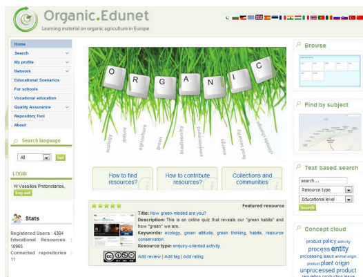
Fig. 5. The Organic.Edunet Web portal

The Organic.Edunet Web portal ( www.organic-edunet.eu ) is a multilingual (its user interface has been translated in eighteen languages so far) learning portal that was developed during the Organic.Edunet EU eContentPlus project ( http://project.organic-edunet.eu ). The portal provides a single point of access to almost 11,000 digital resources related to green topics, mostly organic agriculture and agroecology, but also environment, biodiversity, energy, sustainability and related topics. The initial content providers of Organic.Edunet were consortium members of the Organic.Edunet project, including a number of digital collections from European Universities along with established organizations such as FAO ( www.fao.org ), Organic Eprints ( www.orgprints.org ), Soil Association ( www.soilassociation.org ), Organic Agriculture Information Access ( http://quod.lib.umich.edu/n/nal ) and others. Nowadays, this number of content providers is constantly increasing and now initiatives such as Digital Green ( http://digitalgreen.org ) and Green OER-C ( www.oercommons.org/green ), which are closely related to the scope of the portal, are in the process of making their content available through the Organic.Edunet Web portal (Fig. 5).