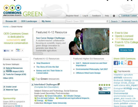
Fig. 6. Home page of the Green OER Commons learning portal

The Green OER-C portal ( www.oercommons.org/green ) is a learning thematic portal, dedicated to OER that deals with green topics (Fig. 6). It is a project in OER Commons developed by ISKME in partnership with Agro-Know Technologies. This portal aims to provide access to quality, green OER coming from various sources. For example, a number of the resources available through the portal are already available through the generic OER Commons portal ( www.oercommons.org ), so they were selected and “channeled” to the Green OER-C portal by applying the appropriate filters. Another source of OER for this portal is the contribution of resources by individuals, who are willing to register and follow the simple process of providing the required metadata description for the corresponding resources. These resources undergo a quality assurance process, during which the validity of the metadata, their relevance to the scope of the portal as well as the relation of the resource itself to green topics covered by the portal are evaluated before they are approved.