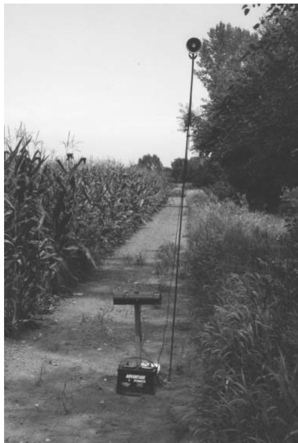
Figure 1. Infrared transmitting unit (left) and receiving unit (right) of the deer-activated bio-acoustic frightening device along the edge of a cornfield.

We used indices of track counts, corn yields, damage assessments, and use-areas of radiomarked deer to evaluate the efficacy of the frightening devices. A tractor-mounted 2-m-wide drag was used to establish and maintain a smooth dragline around the perimeter of each field. We counted tracks of deer entering and leaving cornfields in the 1 m of dragline nearest the corn about every 6 days. A single observer counted tracks on all fields to eliminate observer bias. We recorded 1 track count