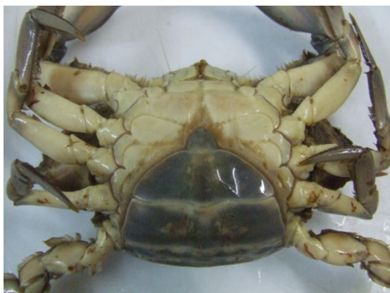
Figure 4 Abdomen of the siri adult female ( Callinectes sp.).

There have been very few published works elaborating emic identification keys, as for example that of Mourão and Montenegro [6] for fish at the MRE, in Paraíba State, Brazil. The confection of an emic identification key repre-