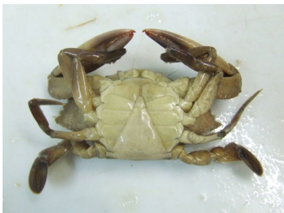
Figure 3 "Siri donzela"/ Callinectes sp. (Photo: Pollyana Dias, 2007).

observed differential denominations for young fishes and shrimps.