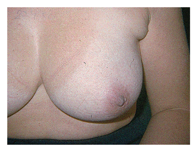
FIGURE 1: Ectopic axillary breast.