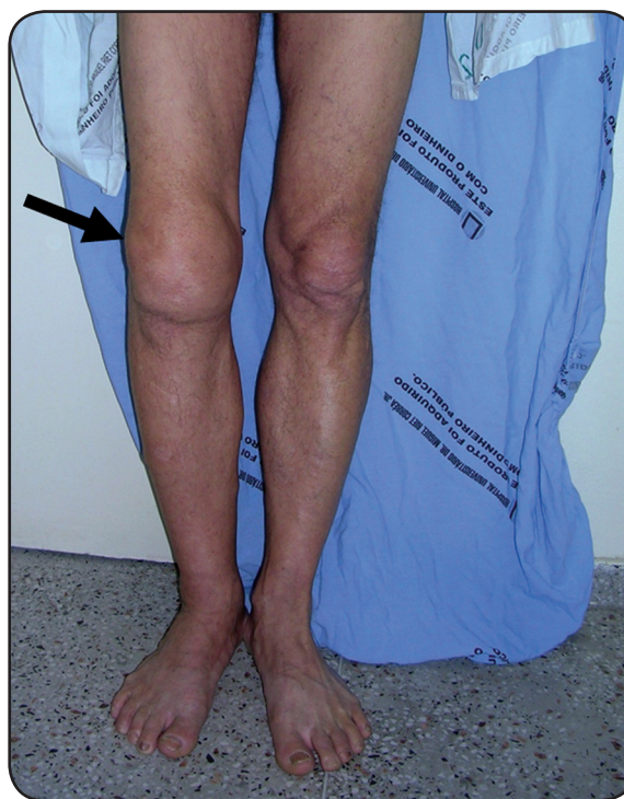
FIGURE 1 - Black row showing swelling in the right knee of the patient with monoarthritis by Sporothrix sp. (Case 1).

exams of the sinovial fluid showed no microorganism growth in bacterial and fungal culture. Clinical examination revealed pain with high intensity, difficulty walking, and flogistic signs on the affected joint ( Figure 1 ). Ultrasound imaging showed an extensive suffusion with a viscous fluid and suprapatellar bursa distension. Suspecting of a septic arthritis reactivation an arthrocentesis was done. Cytology of synovial fluid revealed a count of 800 erythrocytes/mm 3 and of 3,200 leukocytes/mm 3 with 53% of lymphocytes and 47% of segmented neutrophil. Biochemical examination was not done due to the synovial