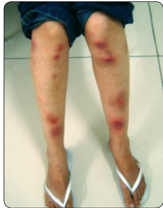
FIGURE 3 - Skin rash due to a hypersensitivity reaction in a zoonotic case of sporotrichosis (Case 3).

Female patient, 28 years-old, student, referred the appearance of a skin lesion about 15 days after a scratch of a cat with sporotrichosis. Physical examination revealed a 3cm pustular lesion with violaceous borders in the trauma region in her forearm, associated with a more recent 2cm lesion, nodular, erythematous and firm, following the lymphatic vessel. After eight days of the initial skin lesions at forearm, multiple painfull reddish nodules appeared in her both legs ( Figure 3 ), featuring a typical case