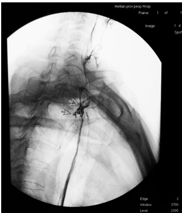
FIG. 3 Open anastomosis during a barium meal test (black arrow) and compression of the esophagus by the upper portion of the stomach (white arrow)

than that of acid regurgitation (9.8 and 8.9 %, respectively). Although it was thought that the pyloroplasty could reduce the occurrence of reflux, we only dissociated the connective tissue around the pylorus instead of conducting pyloroplasty, and no severe duodenogastric reflux occurred. 26 We thought that the gastric acid secretion of a nerve-free stomach could gradually recover over time, which was demonstrated by comparing the 3- and 6-month data, while no obvious change in acid regurgitation rate was observed, similar to other published results that indicated that embedding in the proximate stomach presented an antireflux effect. 25