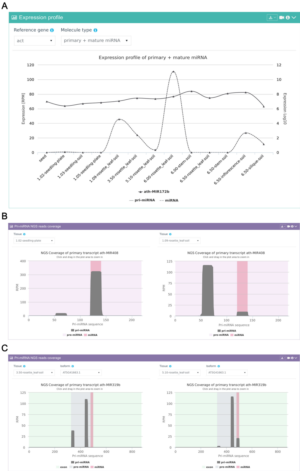
Fig. 3 Representative visualizations of miRNA gene expression: a a line graph displaying combined expression of pri-miRNA (RT-qPCR) and mature microRNA (NGS) for miR172b. b The expression pattern of miR408/miR408* across various stages of arabidopsis development, and c the coverage pattern of sRNA fragments on the pri-miR319b transcript sequence