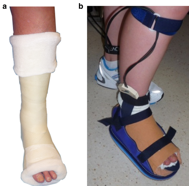
Fig. 1 The TCC (a) and shoe-cast (b) conditions

was comparable between conditions (TCC 0.77 \pm 0.21 m/s, shoe-cast 0.79 \pm 0.23 m/s) ( p > 0.05 ).