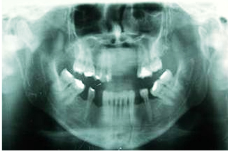
Figure 1 Pre operative Orthopantomograph.