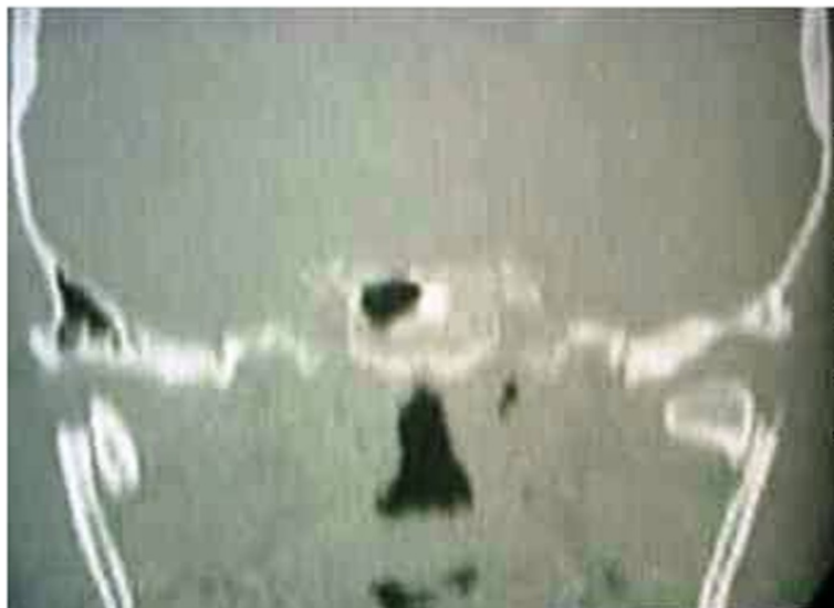
Figure 2 CT scan that indicat surgical treatment.

Also the age of the patient governs the type of therapeutic treatment. During the years of growth some authors have found a greater capacity for morphofunctional recovery of the fractured condyle in comparison with adult patients. Thus the therapeutic approach can vary not only according to the type of fracture, but also the type of patient. The two main therapeutic directions envisage on the one hand orthopaedic-functional treatment and on the other surgical treatment. Orthopaedic-functional therapy remains the most commonly used by various authors, permitting as it does an optimal functional recovery. Here it must be underlined that an intermaxillary blockage determines two main problems; as well