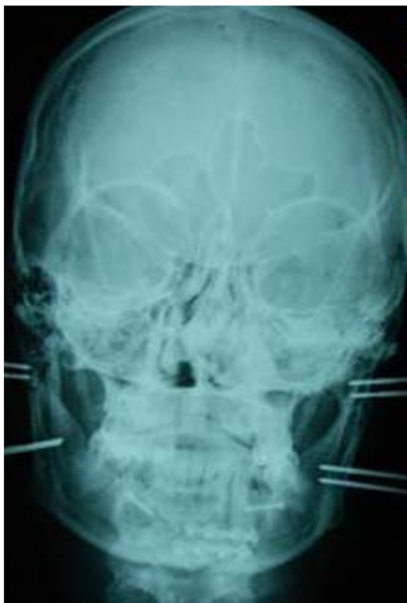
Figure 5 Post surgical CT scan.

these cases, conservative therapy, whilst assuring good dental occlusion in general terms, often does not allow complete recovery of the mandibular movements [15]. Moreover, in the opinion of other authors too, it is difficult to achieve completely satisfactory results from both an aesthetic viewpoint (due to the reduction in height of the ramus) and a gnathological standpoint because of the frequent presence of pre-contact during mandibular movements. Very recently, the direction of the treatment to resolve the greatest possible number of problems linked to fractures of the mandibular condyle, is fast tending towards a surgical approach, thanks not only to new physio-biomechanical acquisitions of the complex temporal-mandibular joint, but also to the development of new surgical techniques such as REFs which allow an optimal adaptation of the fractured fragments without the need for inter-maxillary blockage and the resultant immobilisation of the temporal-mandibular joint. Broadly speaking, the choice of surgical technique is conditioned by various factors such as : the focus of the fracture, the position of the condyle, the time elapsed from the traumatism, the extent of local oedema the type of surgical.