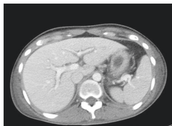
Figure 1 Contrast-enhanced computed tomography scan showing axial section of the patient's upper abdomen. Note the peri-portal hypodensity at the level of the hilum, which is confined to the main portal veins and the first-order branches, consistent with peri-portal lymphedema.

At the patient's follow-up visit at the clinic, he showed dramatic improvement in his general condition. CT scans