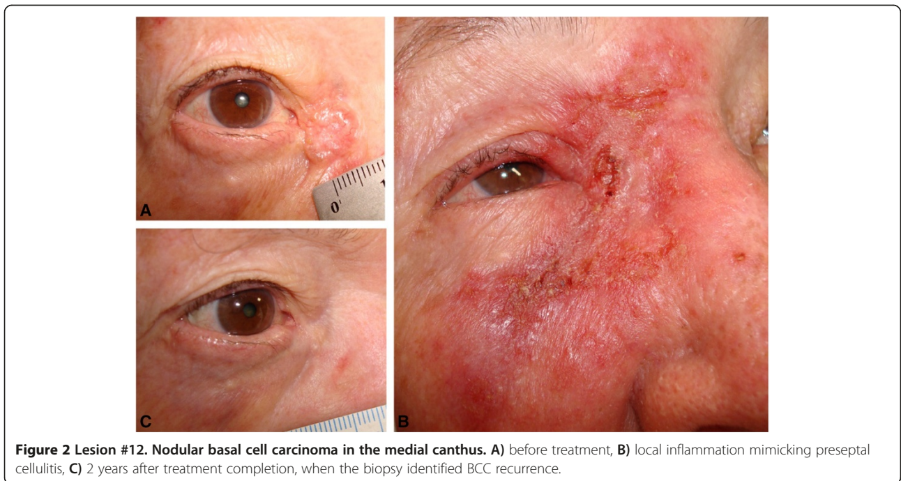
Figure 2 Lesion #12. Nodular basal cell carcinoma in the medial canthus. A) before treatment, B) local inflammation mimicking preseptal cellulitis, C) 2 years after treatment completion, when the biopsy identified BCC recurrence.