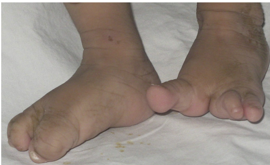
Figure 2 Ectrodactyly of feet.

Ectrodactyly refers to a deficiency or absence of one or more of the central digits of the hands and feet. Ectodermal dysplasia involves organs derived from