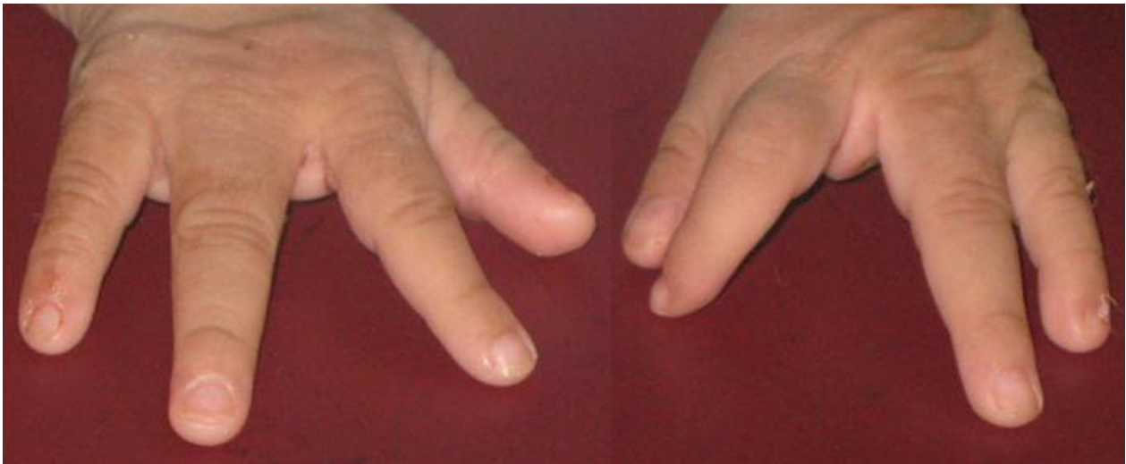
Figure 1 Ectrodactyly of hands.

cleft palate. Her scalp hair was sparse and hypopigmented and her skin was dry and rough. Both hands showed a classic lobster claw deformity: her middle digit was absent and the remaining four fingers were parted, two on either side, the cleft almost dividing the palm into two (Figure 1). The second and third toes of both her feet were missing and the remaining three toes were divided by a cleft into two parts, the big toe on one side and the other two toes on the other side (Figure 2). Her external genitalia were female. Laboratory tests, including a complete blood count, electrolytes and liver tests and kidney, thyroid, anterior and posterior pituitary functions tests, showed no abnormalities. A chest radiography, abdominal ultrasound, echocardiography,