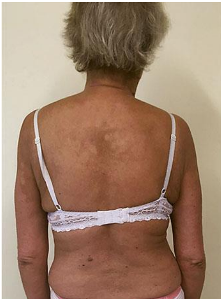
Fig. 3. Clearance of the erythrodermic rash with remaining postinflammatory skin spots 2 weeks after the withdrawal of adalimumab.