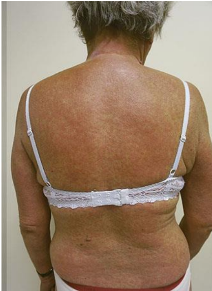
Fig. 2. Papular erythrodermic rash on the trunk 1 week after the initiation of adalimumab.