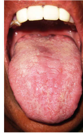
FIGURE 2: Central transverse type.

in the study. A detailed history regarding the demographic data, systemic health, and associated tongue symptoms was recorded. Medical history of the subjects was confirmed after evaluating their recent medical records. The subjects were seated on the dental chair and were examined using mouth mirror and straight probe and under illumination with dental chair light. Study subjects were asked to swish the mouth with sterile water before performing an intraoral examination of the tongue. The study subjects were asked to open the mouth and protrude the tongue as much as possible. The subjects were examined with sterile gloves and sterile gauze was used to hold the tip of the tongue to ease complete examination of the tongue. Clinical analysis regarding the pattern of fissuring of the tongue, number of fissures in tongue, and associated tongue anomalies was recorded. Statistical analysis was performed and a P value < 0.05 was considered to be statistically significant.