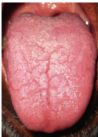
FIGURE 4: Branching type.