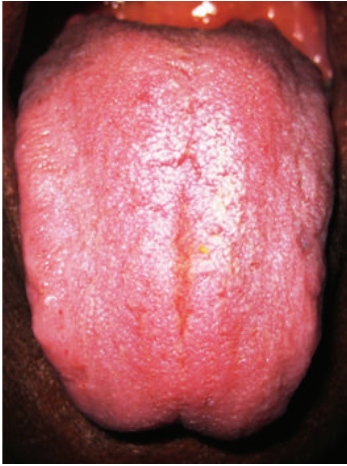
FIGURE 1: Central longitudinal and coated tongue.