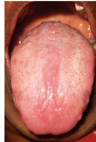
FIGURE 3: Lateral longitudinal type.

the central longitudinal fissure (branching tree appearance).