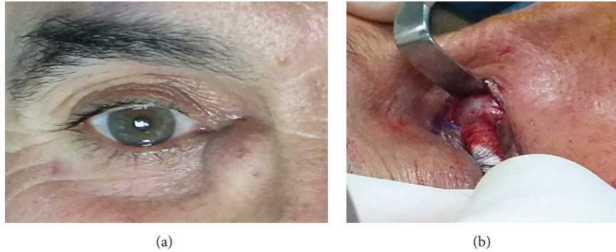
FIGURE 1: (a) 54-year-old male patient. In the right eye lacrimal sac region, a solid, immobile mass is observed, pressure on which does not cause pus discharge. (b) Perioperative image of the lesion. It is observed that the lacrimal sac is quite big and has a bluish color.