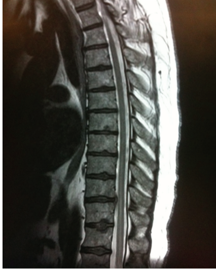
FIGURE 1: MRI thoracic spine showing acute spinal cord infarction. Sagittal T2-weighted MRI of the patient's thoracic spine demonstrating nonspecific central intrinsic signal hyperintensity of the spinal cord located in conus region with extension to T8 level. Multilevel thoracic disc disease at T1 and T10-T11 is also present.