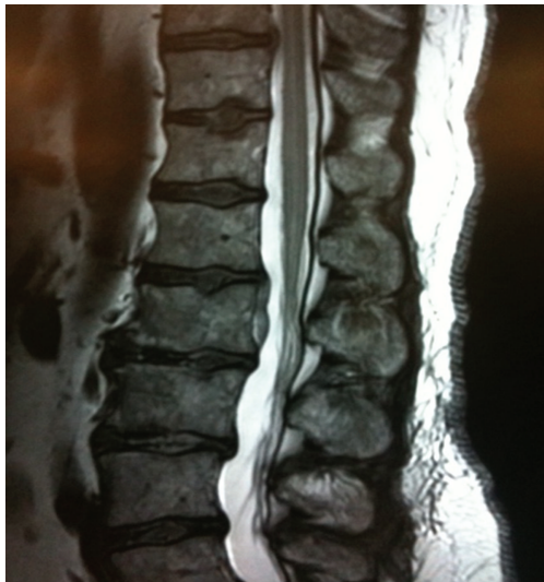
FIGURE 2: MRI of the lumbar spine showing acute spinal cord infarction. Sagittal T2-weighted MRI of the patient's lumbar spine showing a nonspecific central intrinsic signal hyperintensity of the spinal cord located in conus region with extension to T8 level. Image also shows multilevel degenerative disc disease with noncompressive disc herniation at L1-L2.

per minute, oral temperature of 96.8 degrees, F and SpO 2 of 97% on room air. The patient presented with 0/5 strength and decreased sensation to light touch and areflexia of the bilateral lower extremities. Noncontrast computed tomography (CT) of the head showed a remote lacunar infarct. CT angiography of the abdomen and pelvis showed no evidence of pulmonary embolus, abdominal aortic aneurysm, or