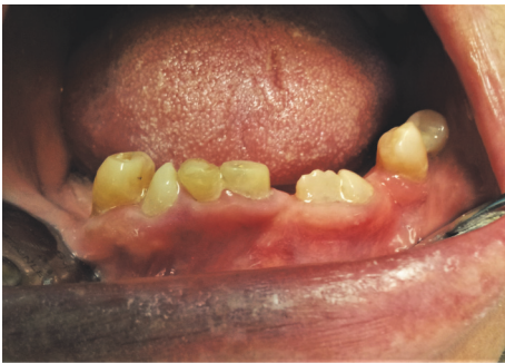
FIGURE 2: The initial situation at greater magnification.