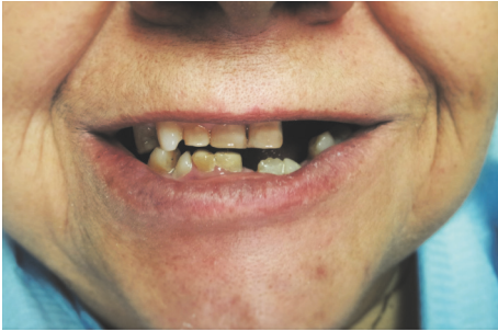
FIGURE 1: Initial clinical situation.