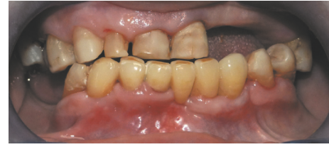
FIGURE 4: The final phase of prosthetic rehabilitation.

Stumping with cutters was next done, in order to chamfer the teeth in question to 45°, while respecting the parallelism of their interproximal sides; as little dental tissue as possible was removed. After making impressions of the teeth with precision material, a temporary prosthesis was prepared; once the substructure in zirconium was put in place, the occlusion in the anterior region was checked. Having established the validity of the prosthesis, its definitive realization in zirconium-ceramic was accomplished. The result gave the