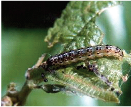
Larva of leaf roller