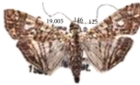
Adult moth of leaf roller