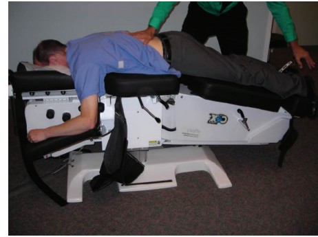
FIGURE 1: The LVVA-SM technique as performed clinically.

2.1. Animals. All methods were approved by the Institutional Animal Care and Use Committee. A total of 32 male Sprague