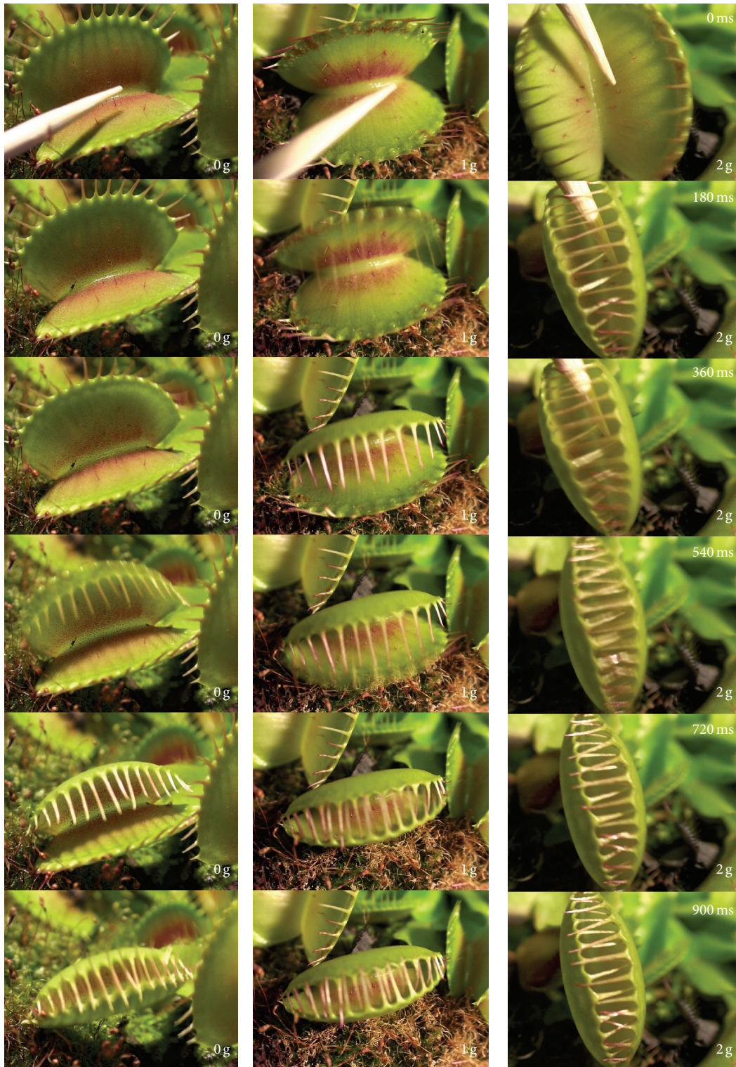
FIGURE 1: Closing of the trap in micro- (0 g), normal (1 g), and hypergravity (2 g).

the trap closure suggest an alteration in the generation or propagation of the APs in microgravity. In plants, as well as in animals, action potentials are induced by the fast opening and closing of ion channels whose functionality has been little studied and understood in microgravity so far. In fact,