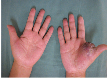
FIGURE 1: Soft tissue mass in the right hand. The mass was located in the first intercarpal space, with the overlying skin showing discoloration.

to low intensity on T1 weighted images and heterogeneously high intensity on T2 weighted images. After intravenous administration of gadolinium-based contrast agent, the mass was well enhanced peripherally, but the central region was poorly enhanced, suggesting necrosis. The mass was adjacent to the first metacarpal bone (Figure 2).