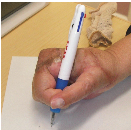
FIGURE 4: Postoperative appearance of the right hand. The patient used the pollicized thumb for activities of daily living, such as writing.