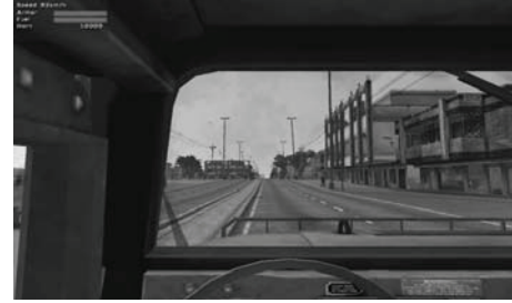
FIGURE 1: Serious gaming environment: low threat zone.

The VE used in both immersion conditions was comprised of a series of low threat and high threat zones in a virtual Iraqi city. In both the high immersion and low immersion conditions, participants experienced the VE from the perspective of the driver of a Humvee. The speed of the vehicle was kept constant as it followed a predefined trajectory to control for time spent in each zone of the VE and to keep that time consistent across participants. Participants were given a basic 10° steering wheel to limit the trajectory, though they were instructed to stay on the road. This allowed for some level of control of the environment without sacrificing experimental control of the stimuli experienced. Low threat zones consisted mainly of a road surrounded by a desert landscape and were free of gunfire and other loud noises (see Figure 1). The high threat zones included improvised explosive devices (IEDs), gunfire, insurgents, and screaming voices (see Figure 2). The