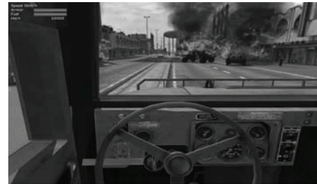
FIGURE 2: Serious gaming environment: high threat zone.

auditory background levels associated with the low threat and high threat zones were identical in both the high and low immersion conditions. Participants passed through three low threat and three high threat zones in an alternating sequence in both immersion conditions. Low threat zones were always experienced first and were used to allow the participant to habituate to the novelty of the virtual environment. High and low threat zones also varied in length, with low threat zones consistently lasting longer than high threat zones. High threat zones averaged 20 seconds in duration, while low threat zones averaged 50 seconds. This was to ensure that zone lengths were not predictable, and so that participants had ample time to return to low levels of responding after experiencing the highly arousing high threat zones. The total length of each run was 210 seconds.