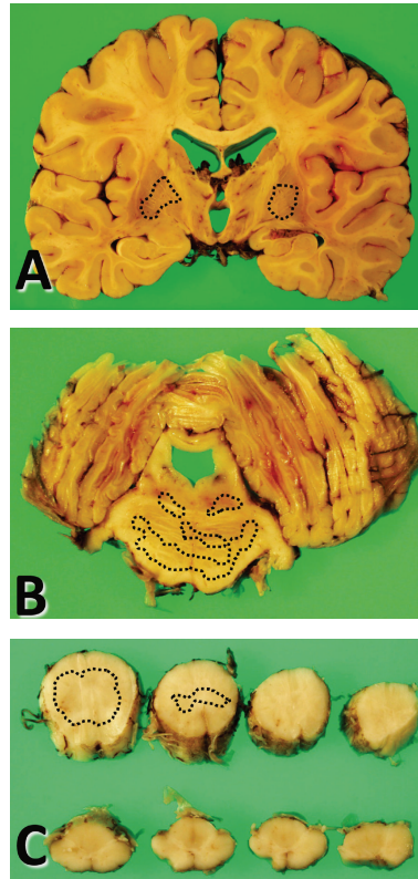
FIGURE 1: (A–C) Macroscopic findings. Severe atrophy of the paleostriatum together with dilatation of the lateral ventricle is evident in the coronal sections, while the thickness of the cerebral cortex is relatively intact (A). The brainstem, the gray matter of the cerebellar hemisphere (B), and the spinal cord (C) also show marked atrophy.

By then he had started to use a wheelchair because of gait disorders, and complained of amnesia. At 46, the patient was diagnosed with spinocerebellar degeneration through extensive neurological tests. The symptoms gradually progressed to repeated episodes of aspiration pneumonia. The patient was found unconscious with cardiopulmonary arrest attributed to aspiration at supper, and despite attempts at resuscitation, he died of multiple organ failure. The autopsy was done 12 hours thereafter.