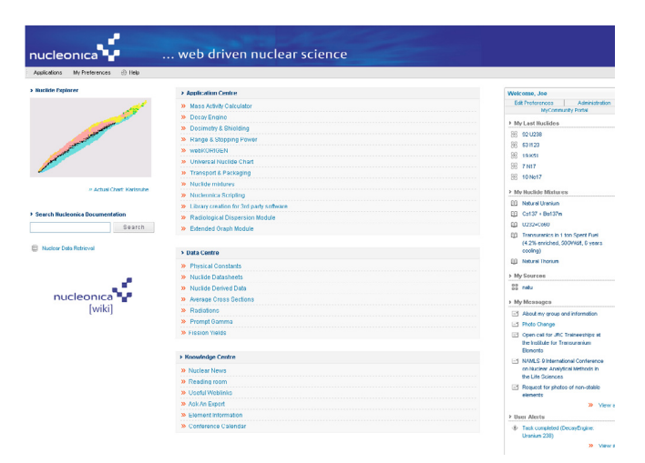
Fig. 1. The NUCLEONICA web portal showing access to the Application, Data, and Knowledge Centres. NUCLEONICA will keep track of user activities by customising (remembering and storing) these in a Personalized Desktop.