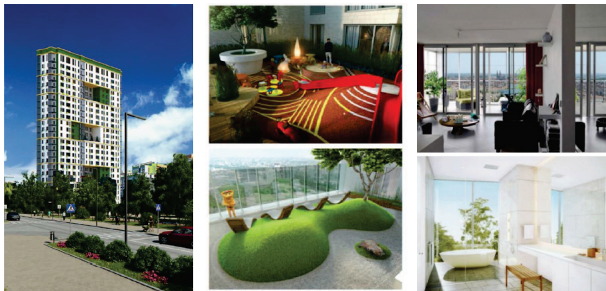
Fig. 4. Visualization of the "green" apartment building.

In the thesis work "The use of energy-efficient standard Green Zoom for design of residential buildings" (fig. 4) the conceptual design of the high-rise apartment building was developed, its evaluation with the Russian system of energy efficiency and sustainability Green Zoom for civil and industrial construction projects has been made.