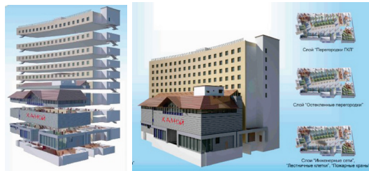
Fig 3. The layer digital model of the trade centre.

On the fig. 3 is the digital model of the trade centre in Ekaterinburg, developed for the Ministry of Emergency Situations to educate members of the organization to rescue operations in case of emergencies. The model allows to disassemble the building in layers and to show all communications.