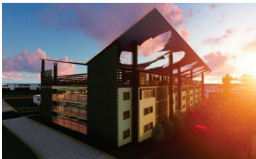
Fig 2. The reconstruction of the residential group in Madrid.

BIM model has all the necessary information. The use of BIM technologies in the reconstruction of buildings is a fairly new and unexplored direction. BIM also allows for designing a reconstruction taking into account new standards for environmental and energy-saving requirements.