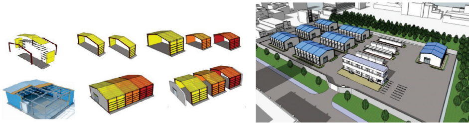
Fig. 1. Stages of designing of innovative Techno Park.

BIM model has all the necessary information. The use of BIM technologies in the reconstruction of buildings is a fairly new and unexplored direction. BIM also allows for designing a reconstruction taking into account new standards for environmental and energy-saving requirements.