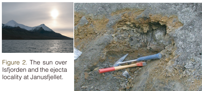
Figure 2. The sun over Isfjorden and the ejecta locality at Janusfjellet.

Deep wells in the Mjølnir impact structure would be of great interest to the international scientific community, in order to study the shock propagation, collapse, and re-sedimentation of the >6-km-thick sedimentary succession. Coring through this succession will make structural analysis and detailed understanding of crater generation and deformation possible and help constrain numerical modeling. However, the costs for deep coring in the harsh environments of the Barents Sea makes it