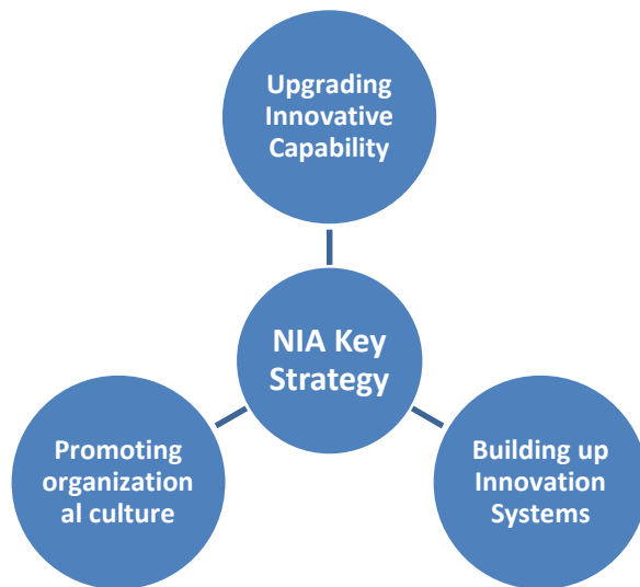
Figure 1. NIA's three strategies for technology and innovation promotion.