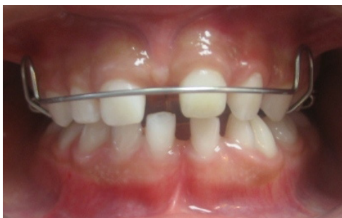
Figure 6. Follow up after 30 days. Usage control of the apparatus is fundamental to avoid possible traumas of the buccal mucosa that might occur with the occlusal changes.