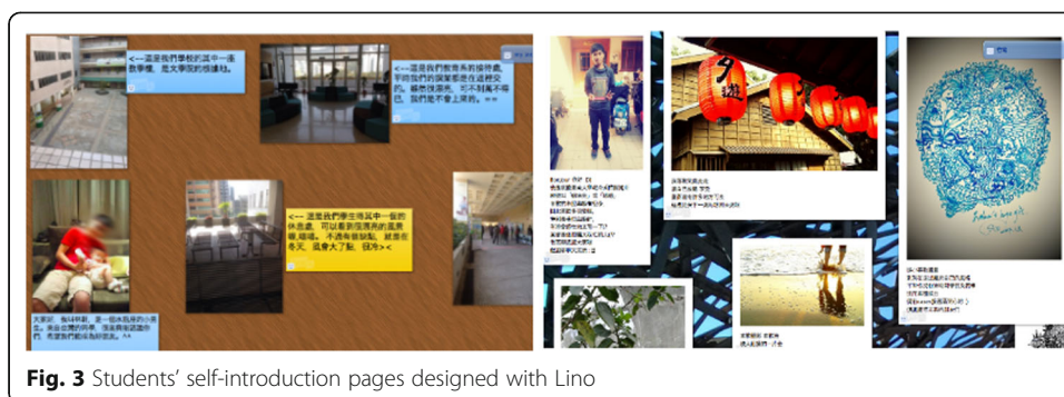
Fig. 3 Students' self-introduction pages designed with Lino

their group presentation to the group to share with the students on the other side. Two Taiwan groups and one Hong Kong group uploaded their work.