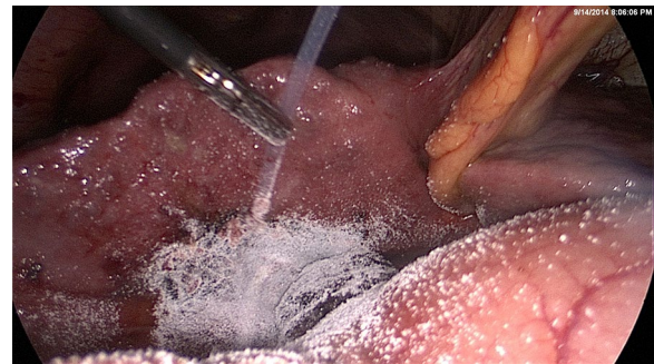
Figure 2 AMP EndoClot™ being applied to the bleeding gall bladder bed via the plastic catheter guided by a grasper.